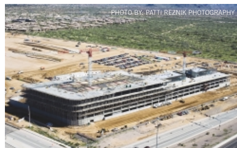
Dial Corp. Headquarters, Scottsdale