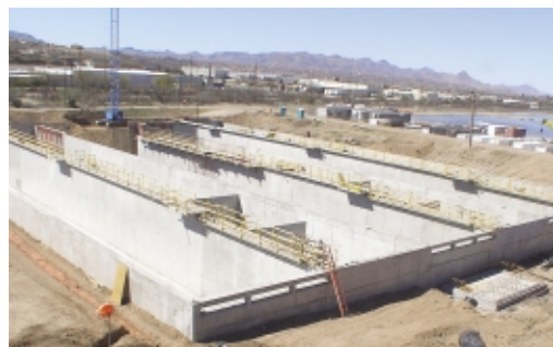
Nogales International WWTP, Rio Rico, Ariz.

PCL was named one of Fortune magazine's "100 Best Companies to Work For" in 2006 and 2007.