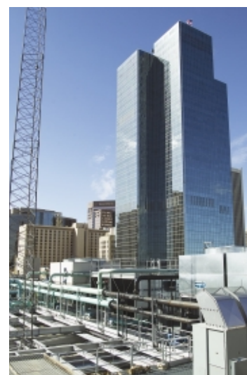
Digital Realty Trust, Phoenix

DPR is currently working on the $45 million Sanofi-aventis Research Center in Oro Valley, which is expected to achieve LEED certification.