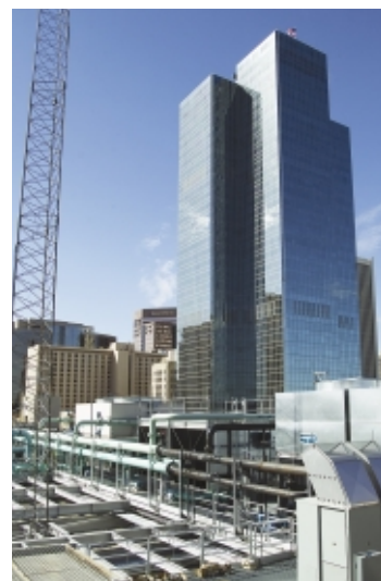
Digital Realty Trust, Phoenix

DPR is currently working on the $45 million Sanofi-aventis Research Center in Oro Valley, which is expected to achieve LEED certification.