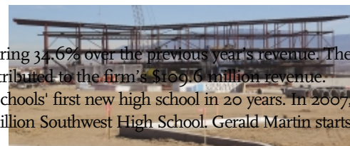
Southwest High School, Phase 1, Albuquerque

"Our success has allowed us to set up offices in Taos and Tempe, Ariz., which we anticipate will help fuel our continued growth," Gorenz says.