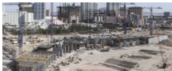
Echelon, Las Vegas