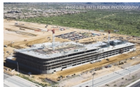
Dial Corp. Headquarters, Scottsdale