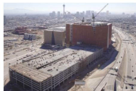
World Market Center, Building C, Las Vegas

Established in 2000, Penta recently opened offices in Reno and Palm Springs, Calif.